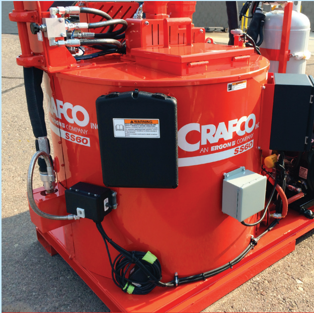
Super Shot 60 Skid-mounted with Shot Timer

The Shot Timer can be installed on any Super Shot model at time of factory order or after deployment – by Crafcro or your own crew.