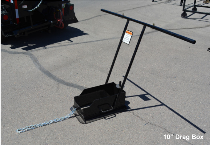
10" Drag Box