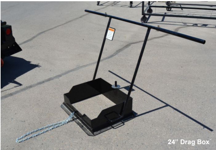
24" Drag Box

The Center Drag Box is compatible with any model year Patcher II, and must be used with one of the following material chutes: