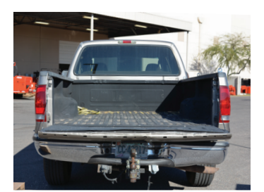
Truck bed after traditional boxed sealant