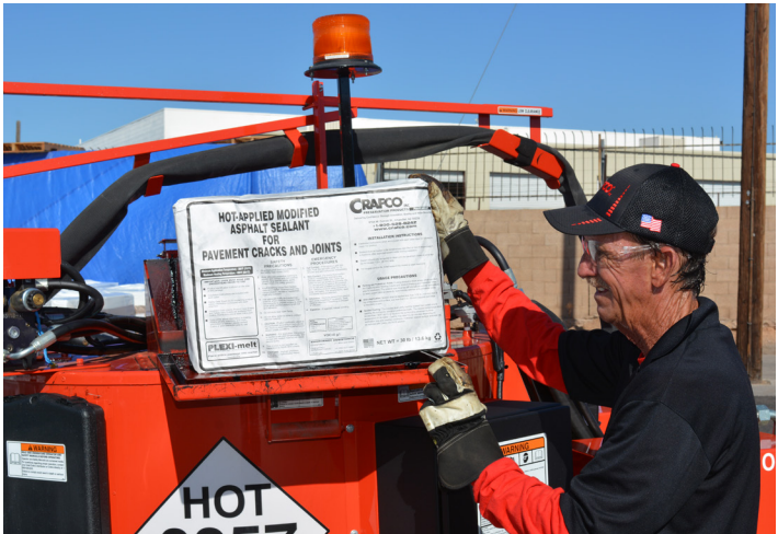
Packaging Details: Block weight 30 lbs. each • 70 blocks per pallet Pallet weight 2,100 lbs. net • Dimensions 12"W x 18"L x 3"H