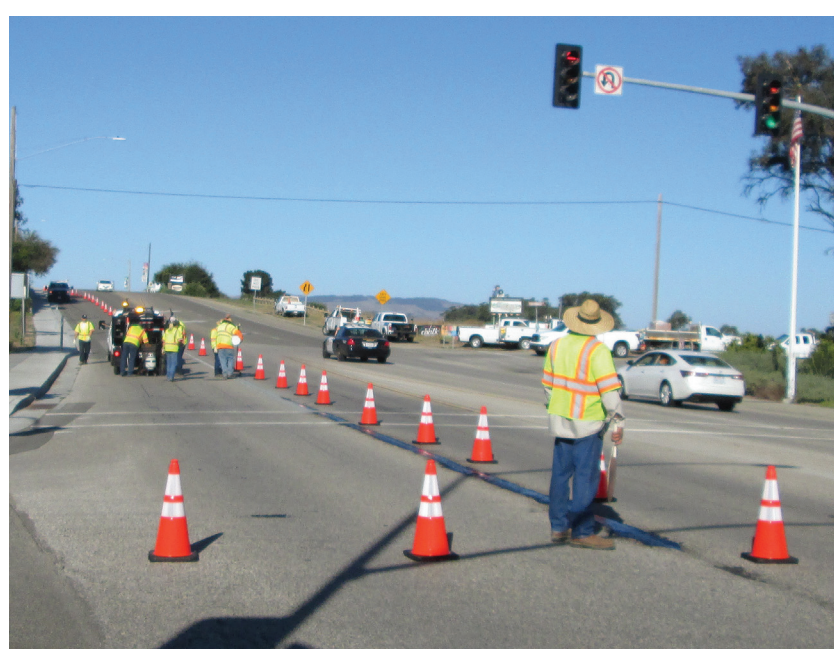
Mastic One cools quickly after installation and is ready for traffic when it has solidified sufficiently to support loads.