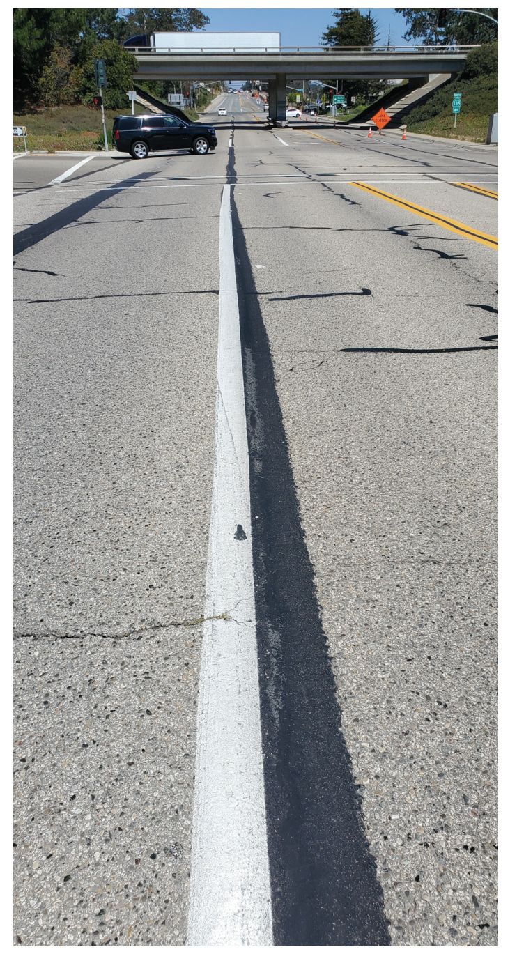
The crew applied 100 yards of the Mastic One material at a time with the drag box, saving the county countless hours.

Traditional HMA patching or mill and fill, which involves grinding out a section larger than the original problem area and filling it in with asphalt, requires considerable planning and time. The process includes milling out and cleaning the area and filling it with asphalt – as well as curing time.